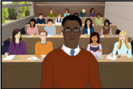
At-Risk for Faculty & Staff: Gatekeeper training for faculty and staff to support students in distress.

This suite of online trainings uses learner-specific practice conversations to build gatekeeper skills to identify, approach and refer students in distress.