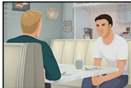
Veterans on Campus Peer to Peer: Training for student veterans to more effectively support their peers.