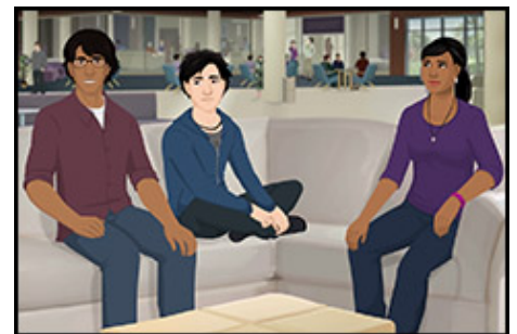
LGBTQ on Campus for Students: Create an inclusive environment for LGBTQ students.