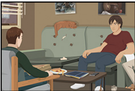
At-Risk for Student Leaders: Gatekeeper training for students to support fellow students in distress.