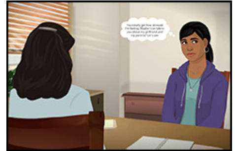
LGBTQ on Campus for Faculty & Staff: Create an inclusive environment for LGBTQ students.