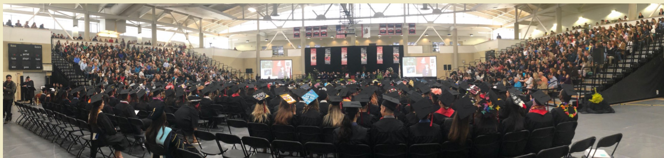
A panoramic view of the Commencement ceremony.