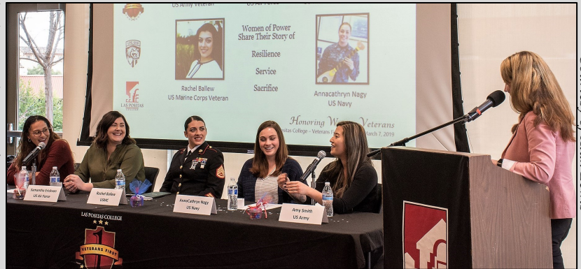
Q & A Panel Discussion Participants.

The LPC Veterans First Program is primarily responsible for the administration of veterans educational benefits programs. They provide other resources and contacts, such as career planning, financial aid, transition counseling services, and other needed services for our returning Veterans.