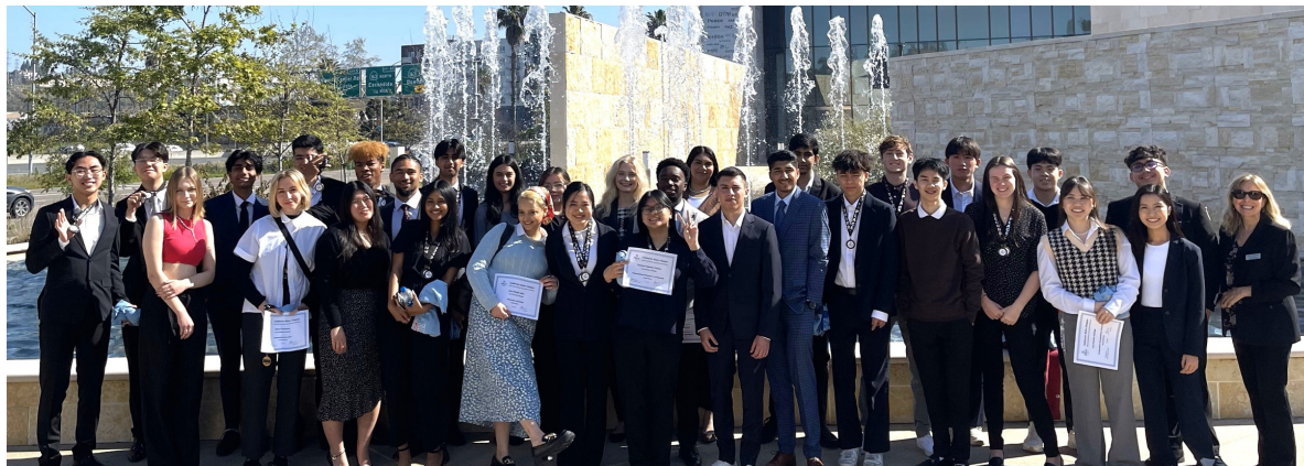
LPC Business Club students celebrate LPC's second place win at the State Business Leadership Conference.

LPC finished in second place at the March 31-April 2 California Phi Beta Lambda State Business Leadership Conference in San Diego, where LPC Business Club students competed with students from two- and four-year colleges and universities.