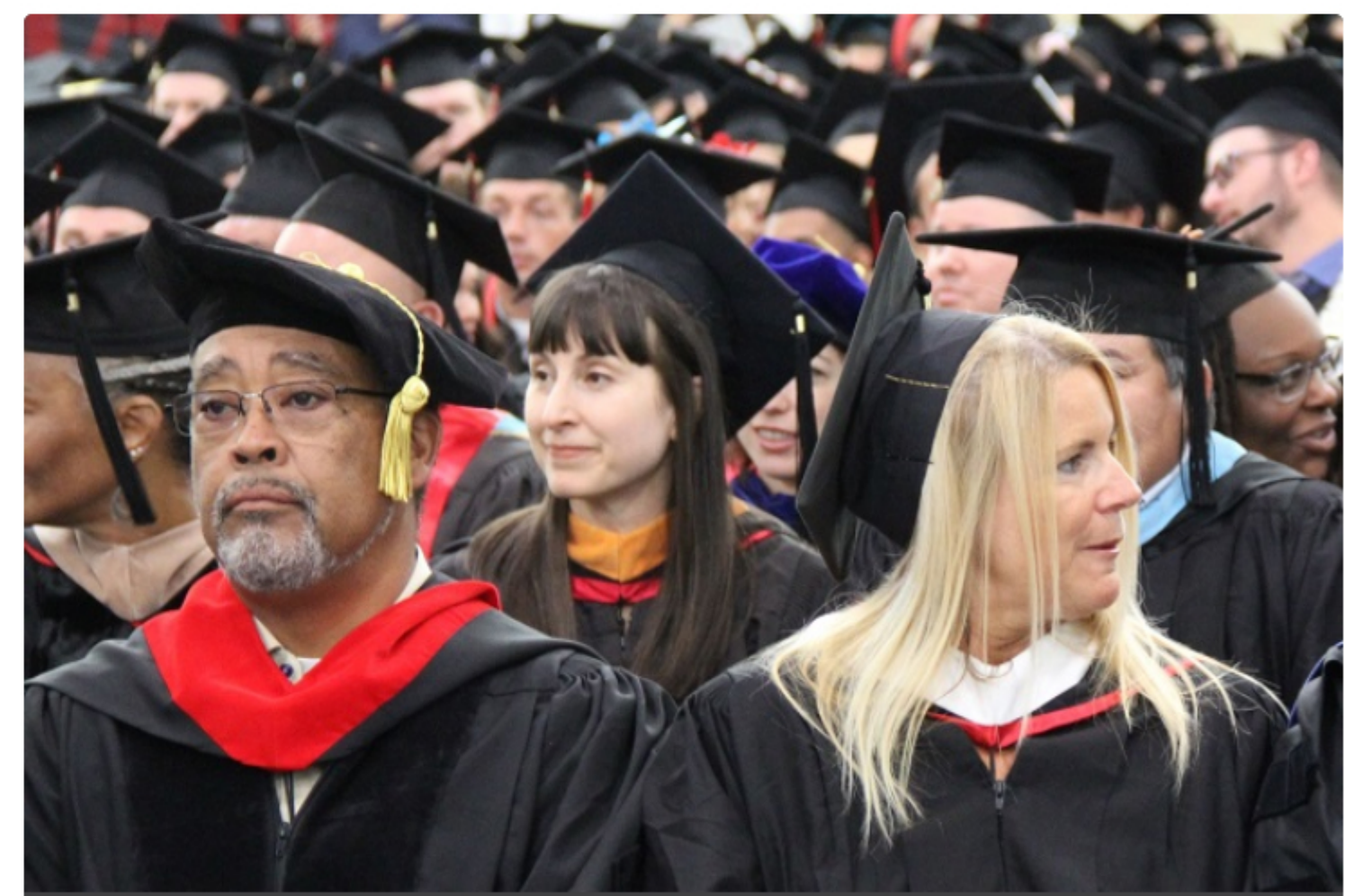
Las Positas College

Equal Employment Opportunity Employer It is the policy of this District to provide equal opportunity in all areas of employment practices and to assure that there shall be no discrimination against any person on the basis of sex, ancestry, age, marital status, race, religious creed, mental disability, medical condition (including HIV and AIDS), color, national origin, physical disability, family or sexual preference status and other similar factors in compliance with Title IX, Sections 503 and 504 of the Rehabilitation Act, other federal and state non-discrimination regulations, and its own statements of philosophy of objectives. The District encourages the filing of applications by both sexes, ethnic minorities, and the disabled.