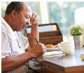
Writing p. 6-7