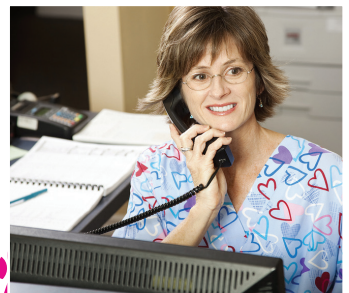
Allied Health p. 12