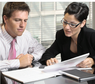
Data Analysis p. 9-10