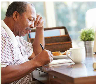
Writing p. 4