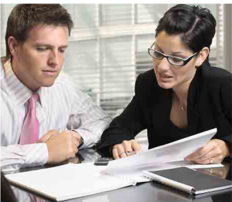
Power BI p. 13