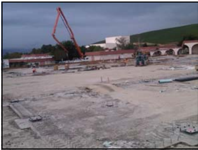
Student Services &amp; Administration Bldg.