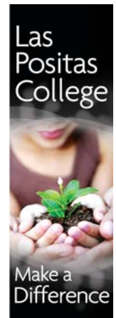
image of the College in the community. There are very clear and concrete examples of the positive impact of the Presidential Advisory Council: they developed the concept behind LPC's Community Leadership Day and served as "ambassadors" at the event; and they had a significant role in the College's strategic planning process and at Visioning Day.

At its two most recent meetings — including one last week on campus — the Advisory Council assessed its efforts and identified areas of success, as well as ways to further contribute to advancing the awareness and