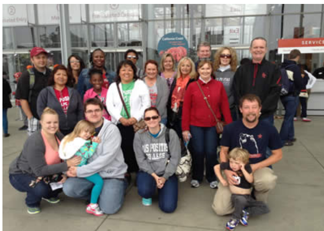
The President and Classified Join up in San Francisco At the Academy of Science in Golden Gate Park on July 18 th

(continued IPBM) and Technology Coordination with District Budget Study Group (DBSG) being dissolved. Membership for all four of the new committees is made up of representatives from all the constituency groups at all of the sites.