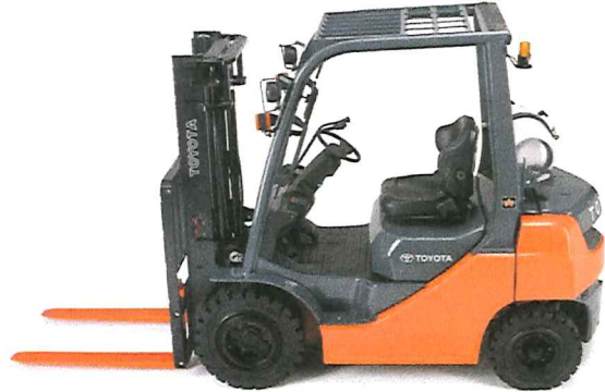
Photo may portray optional equipment not included in your quotation.