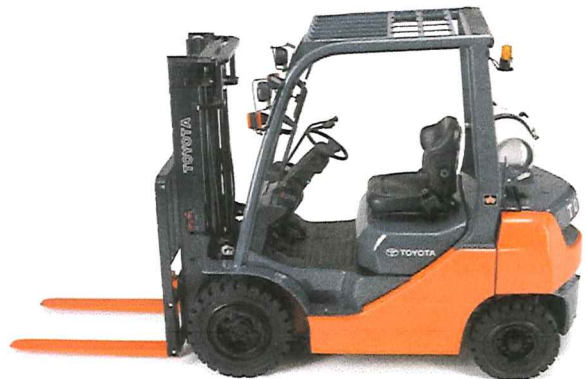
Photo may portray optional equipment not included in your quotation.