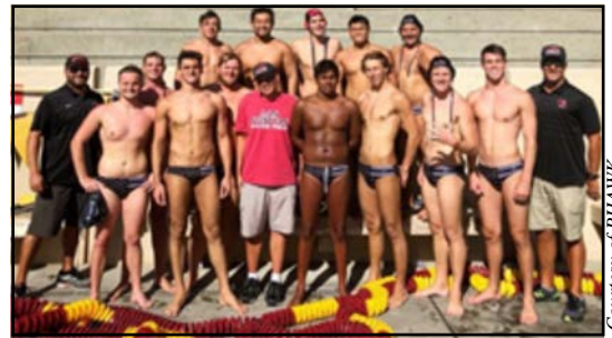
2019 Men's Water Polo Team