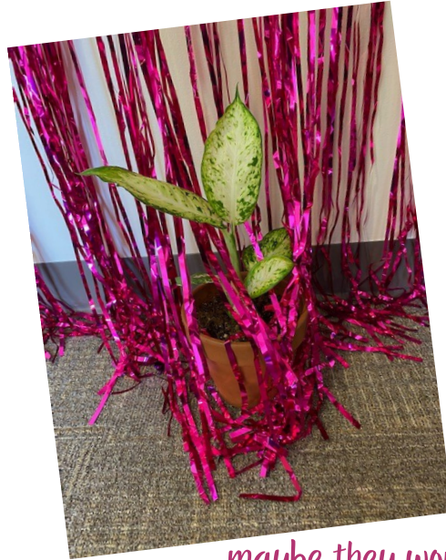
maybe they wont see me.