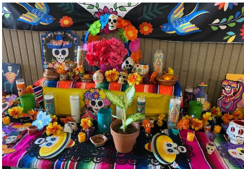
Look at me "I'm part of Dia De Los Muertos"!