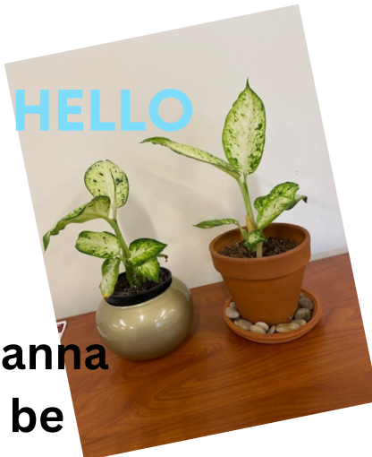
wanna be friends