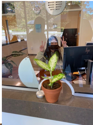
Do you have any appt's left, I need to see a counselor.