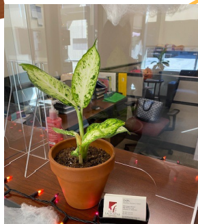
Where do you think I am? ha ha ha