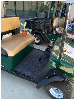
snagged a cart, took a ride around campus.