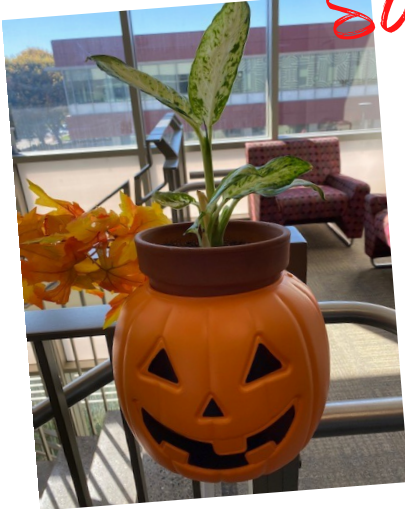
I just want to be a pumpkin 4 Halloween. what do you think?