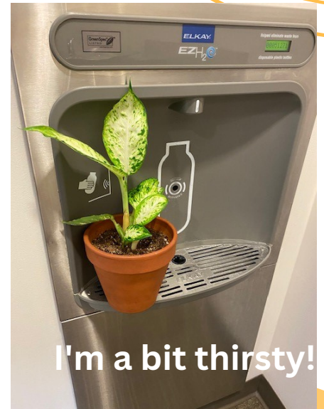
I'm a bit thirsty!