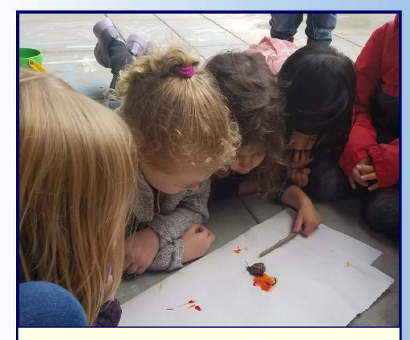
COME EXPLORE WITH US