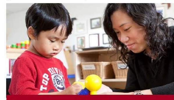
Early Care and EducationMay 12, 3-4PMCLICK HERE

Journalism/Mass Communications May 12, 3-4PM CLICK HERE