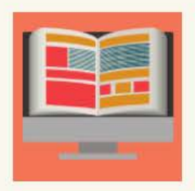
Online Material Access