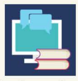
Online Course Support