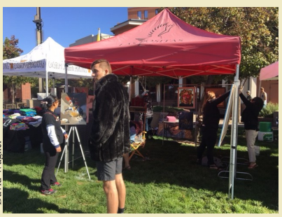
Event-goers view LPC's booth.

The organizers of ArtWalk Livermore again invited LPC students to display their work at this year's event. Students were happy to represent LPC at the well-attended annual event in historic downtown Livermore. It was a great chance for students to learn about the local art scene and promote the college's art department within the community. ArtWalk Livermore has over 200 artists display their works on sidewalks and plazas, in parks and galleries, surrounded by boutique shops, wine tasting rooms and restaurants in historic downtown Livermore. Art works range from contemporary to classical, abstract to realism, pottery to mixed media, handmade bags, and much more.