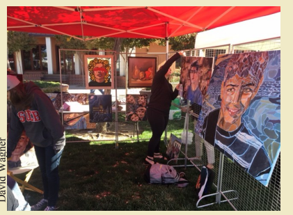
Students hang their work before the event.