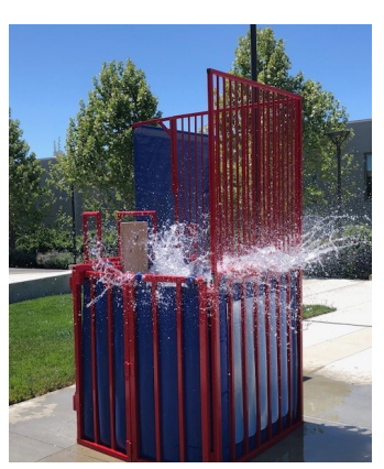
Jared Watanabe goes fishing and swimming in a dunk tank in the LPC quad. The dunk tank was presented by the Hispanic Serving Institution as a fundraising effort