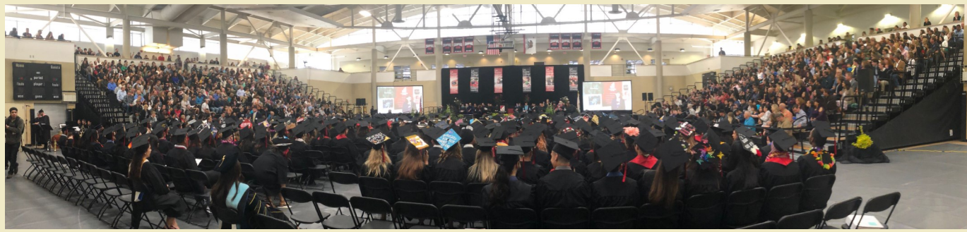
A panoramic view of the Commencement ceremony.