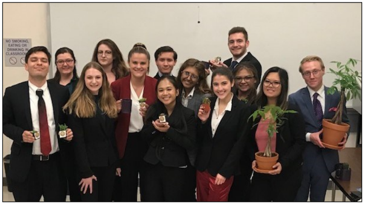
LPC Talk Hawks participants.