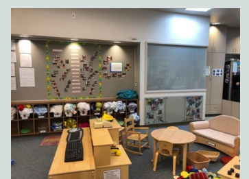
Toddler Classrooms