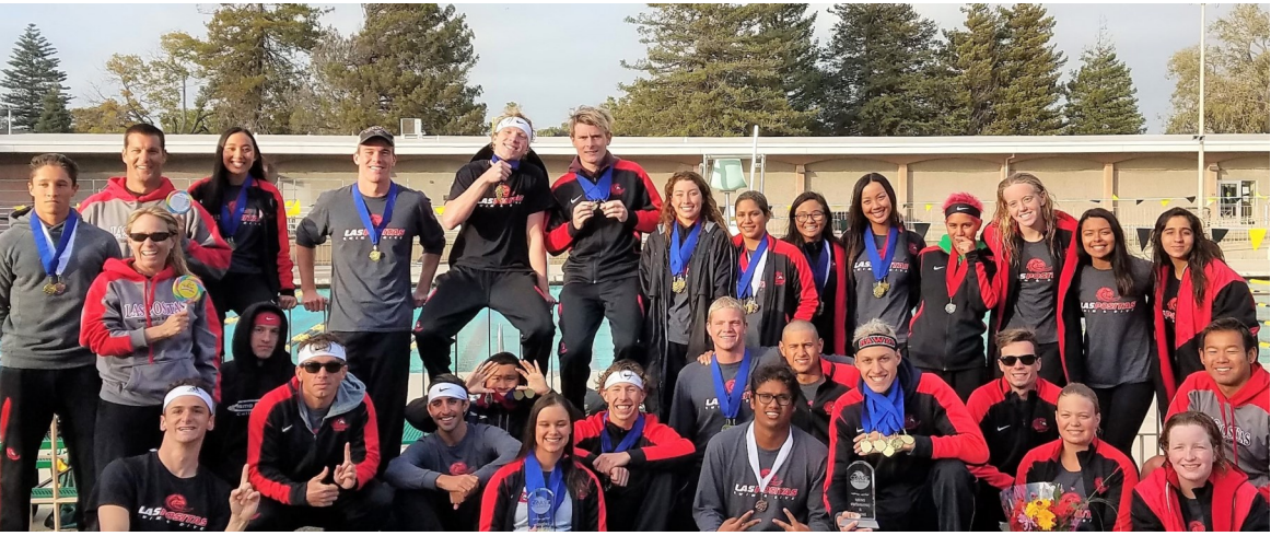
Las Positas College Swim and Dive Team with their Coaches after the Conference Championship.