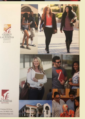
Front and back covers of the LPC folder.