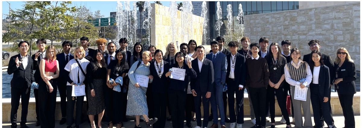
LPC Business Club students celebrate LPC's second place win at the State Business Leadership Conference.

LPC finished in second place at the March 31-April 2 California Phi Beta Lambda State Business Leadership Conference in San Diego, where LPC Business Club students competed with students from two- and four-year colleges and universities.