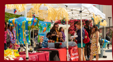
In this Issue